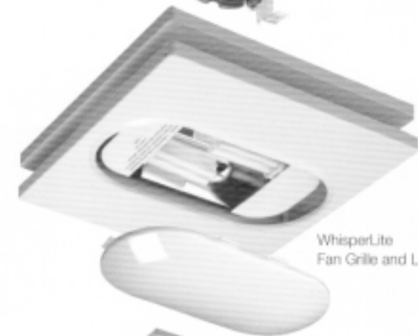
WhisperLite Fan Grille and Light